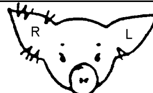
Notch # 47-1

*IMPORTANT - draw the notches exactly as they are in the ears!