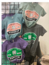
Youth Shirt Colors