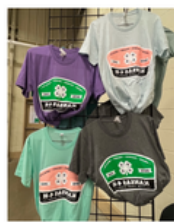
Adult Shirt Colors

https://www.companycasuals.com/4HSParkTees